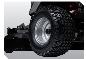
More Traction – Large 22" rear tires with semi-aggressive tread pattern