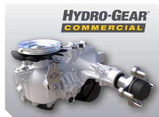
Hydro-Gear® ZT-3100 – Commercial duty drivetrain with serviceable filters