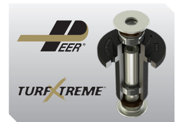
PEER® Spindles – Maintenance free with Contamination Exclusion Technology