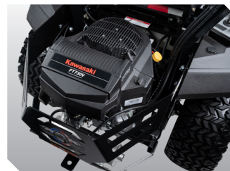
Kawasaki® Engines – Reliable power to tackle the toughest jobs